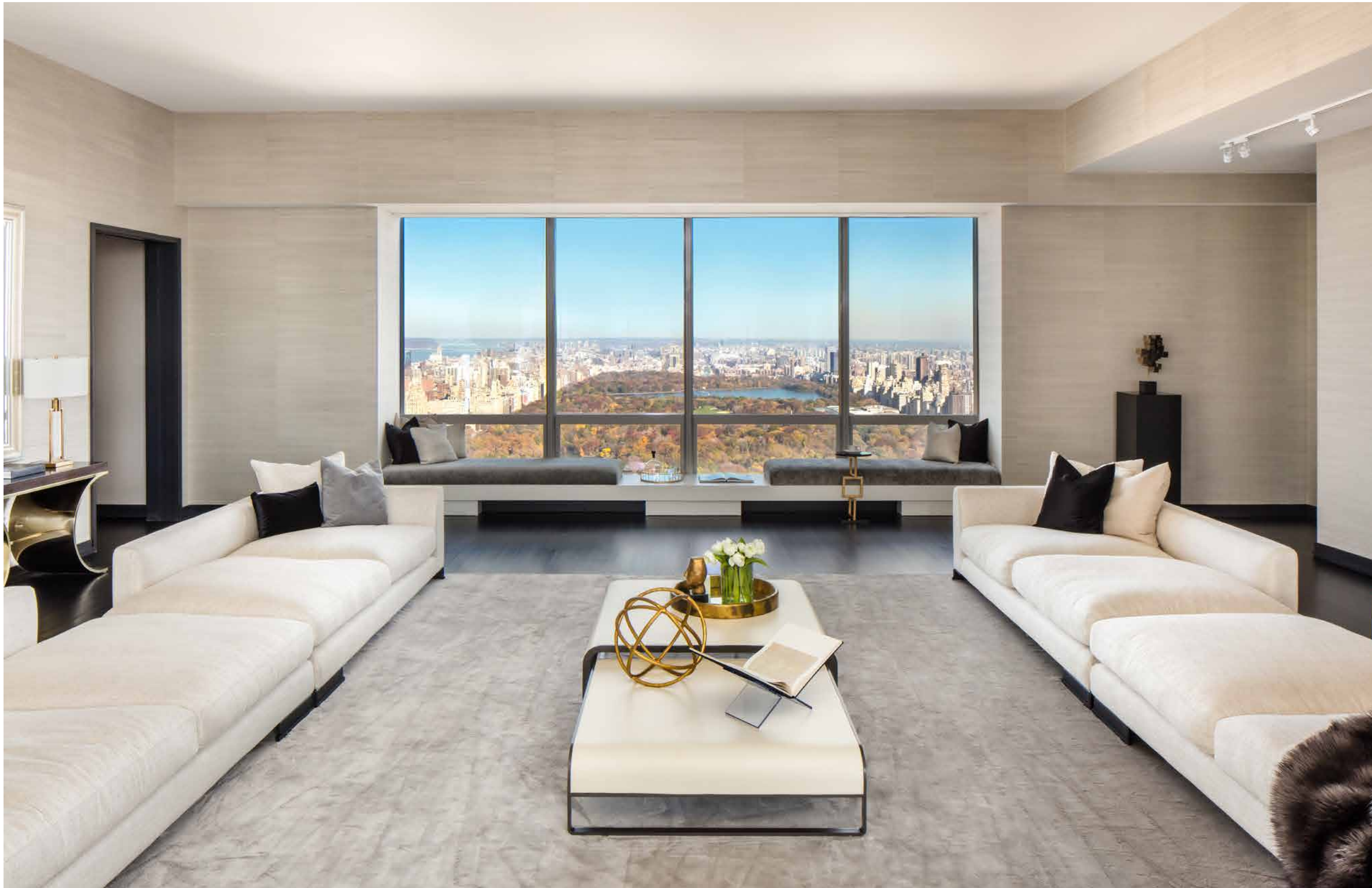
One 57.