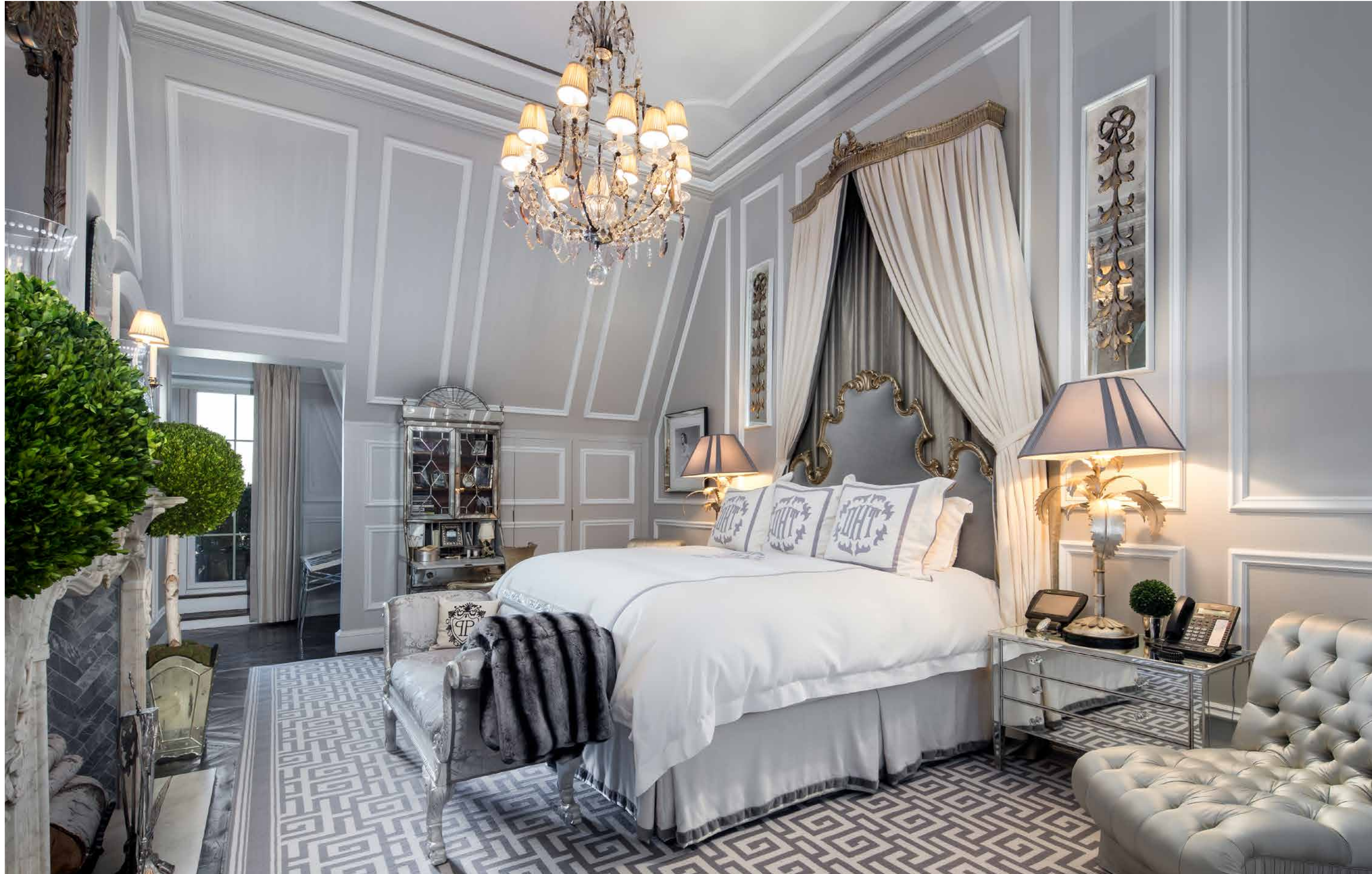
The Plaza.