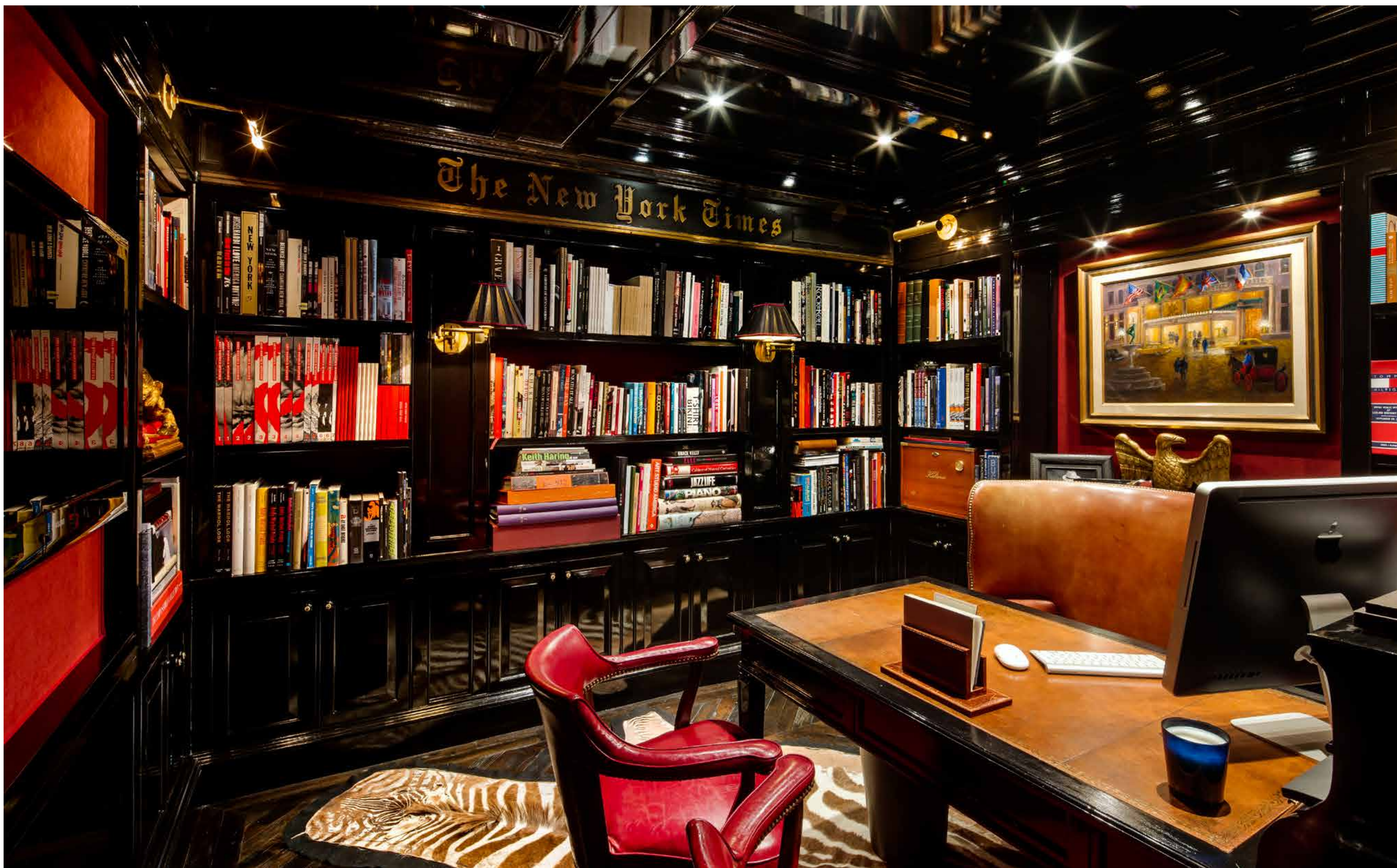
The Plaza.