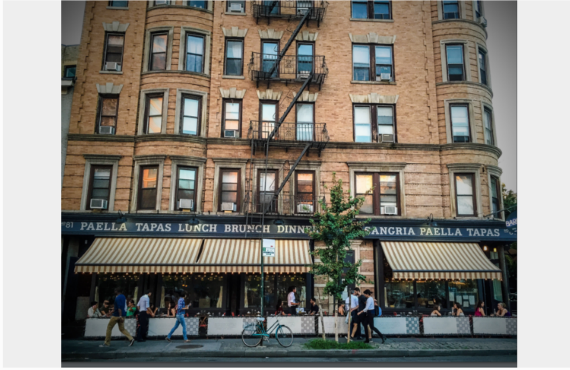
2 BANK STREET.